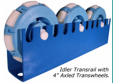
Idler Transrail with 4" Axled Transwheels.

The Idler Transrail comes in 5-foot lengths with closely spaced holes in bottom face for trouble-free mounting. They are available for both the 2" Axled Transwheels (Model 2051A with 25 lb. capacity) and the 4" Axled Transwheels (Model 4201A with 100 lb. capacity.) The Axled Transwheels snap into snug-fitting slots for multiple spacing, and the rails are powder coated blue. The Idler Transrail is ideal for construction of ball tables, diverters, and work stations.