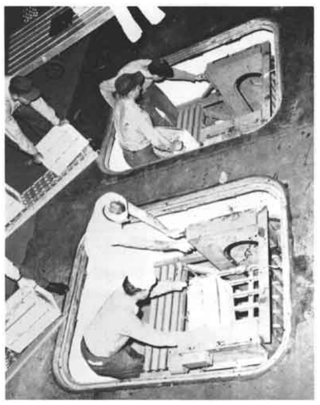
Two 85 lb. Vertiflos provide rapid strikedown of supplies transferred on an aircraft carrier. Flush deck installation.