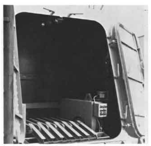
Rear loading station of a 175 lb. Vertiflo Deck House installation.