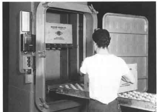
Integral trunk construction save space, weight, cost and installation time. It also improves safety, reduces shipping and installation damage and permits factory wiring, accessory mounting, and accurate assembly.

175 lb. unitized trunk Vertiflo ready for mounting of watertight doors. 4000 lb. Vertiflo in rear.