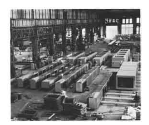
First US Navy trunk units for AF52