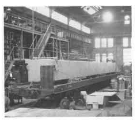
175 lb. trunk unit loaded for rail shipment on one of two interior rail sidings.