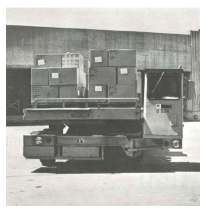
APPROACHING DOCK, driver operates controls to swing his cab aside and to elevate Karry-All cargo deck for perfect line-up with obckside conveyor. He will then lower the cargo restraining bar, clearing the way for unloading.