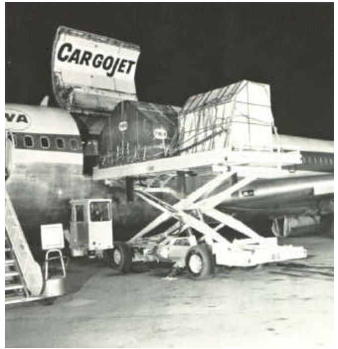
Above, the High-lift Karry-All is being used to transport, elevate, and on-off load. The cargo is loaded automatically, through remote control in little more than one minute per igloo. The High-lift is designed for fast on-off loading.