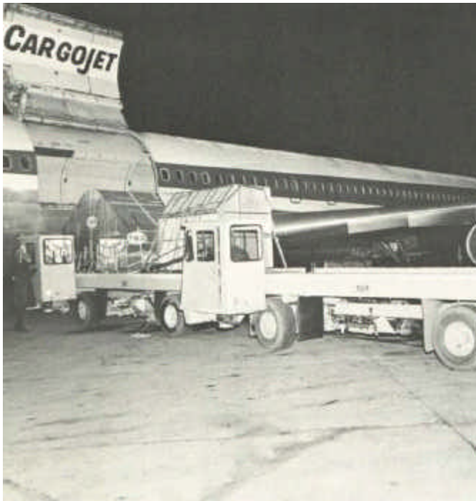
Above, the High-lift Karry-All is used in conjunction with the standard Karry-All. The High-lift remains stationary and provides an elevator loading service—standard Karry-All acts as transport vehicle and also on-off loads the High-lift.