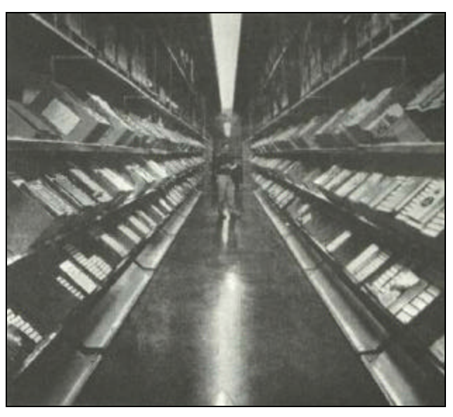
An award winning Cartonflo installation speeds order filling for a famous publisher